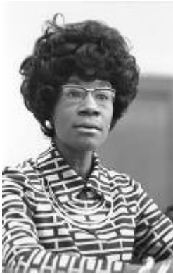
Shirley Chisholm (1924 – 2005)

Shirley St. Hill Chisholm was born on November 30, 1924 in Brooklyn, New York. Her father was from British Guiana and her mother was from Barbados. Shirley received her education from a Barbados school and in NY. She graduated in 1946 from Brooklyn College where she majored in sociology.