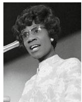
Shirley Anita St. Hill-Chisholm circa 1968 in New York