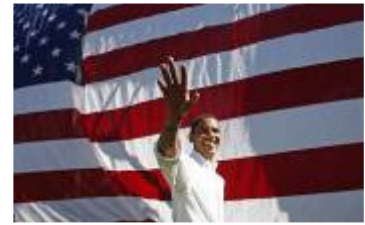
Congratulations President-elect Barack Obama!!!